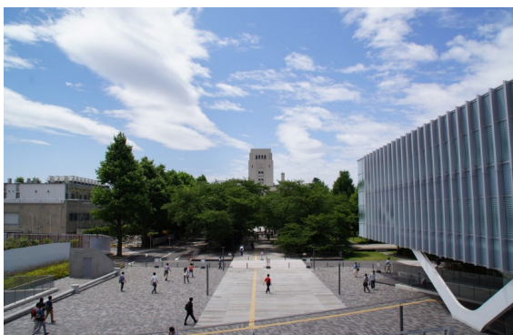
Main Building & Library, Ookayama Campus, Tokyo