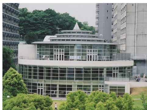
Suzukakedai Campus, Yokohama